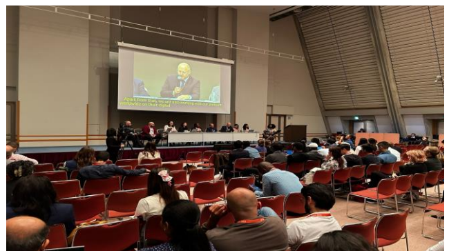
IGF 2023 Global Youth Summit

To effectively engage youth, a dedicated IGF 2023 Youth Track was designed and implemented throughout the year. In cooperation with all Youth IGF coordinators, as well as international youth-focused organisations, the track was designed and delivered through four capacity development workshops hosted in conjunction with regional IGFs , namely EuroDIG in Finland, Youth LACIGF in Colombia, APriIGF in Australia and African IGF in Nigeria, as well as a IGF 2023 Global Youth Summit at the 18th IGF in Kyoto. The track focused on unpacking various digital transformation policy aspects and engaged over thousands of young people.