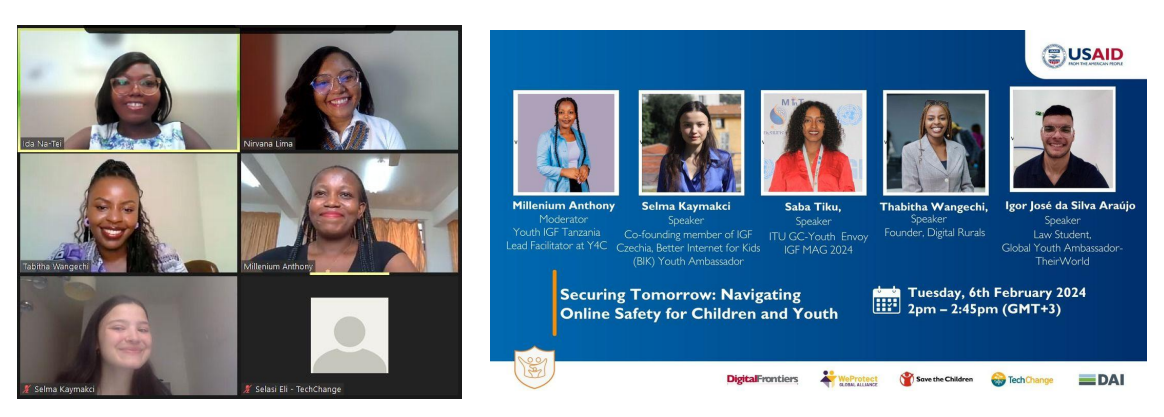
Figure 1: Moments from the Symposium on Protecting Children and Youth from Digital Harm