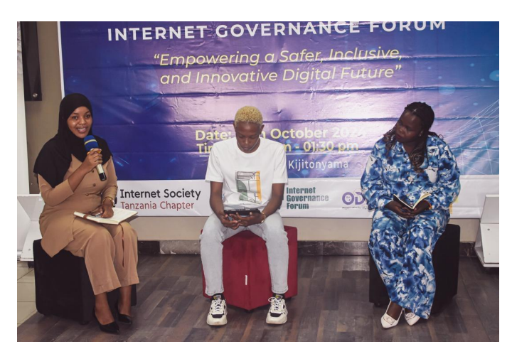
Figure 6: Session on Improving digital governance for the Internet we want