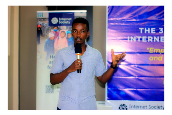
Figure 8: Buni Hub giving closing remarks

Buni Hub concluded the event with remarks emphasizing the importance of youth participation in Internet governance and the need for continued engagement. They also highlighted some of the programs that young people can benefit with through the Hub.