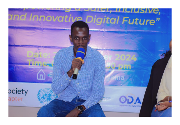
Figure 5: Session on Harnessing Innovation and Balancing risks in digital space